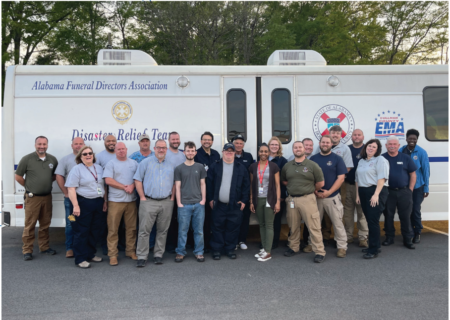
SMORT Training 2023