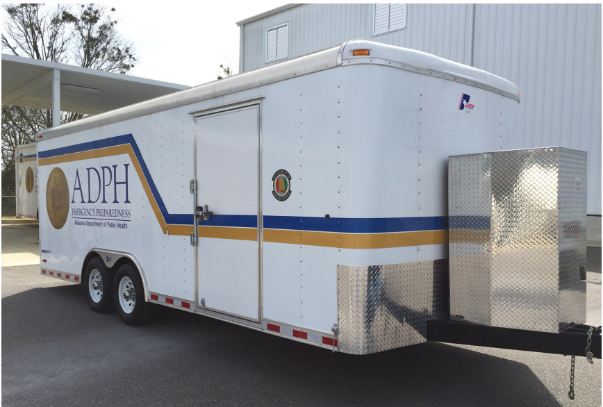
Morgue Operations Support Unit (Trailer)