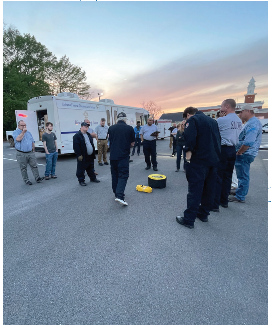
SMORT Training 2023