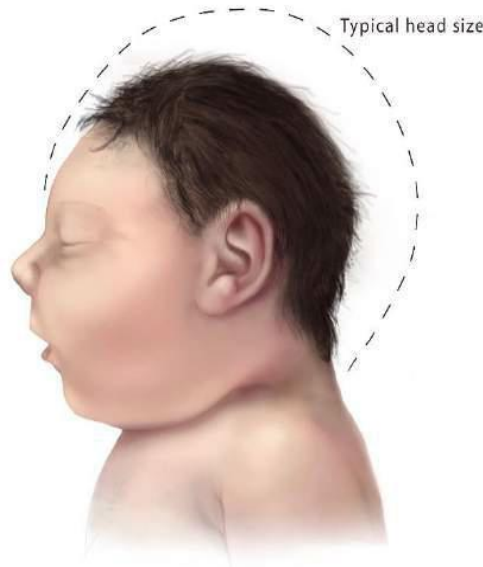
Baby with Microcephaly