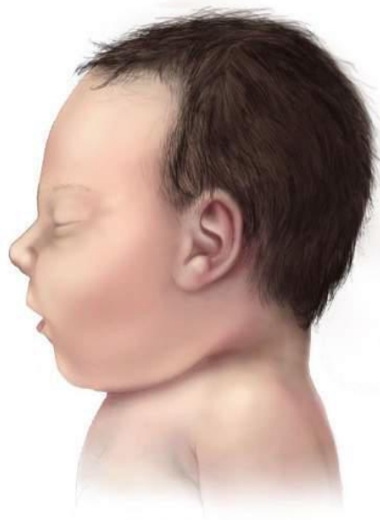
Baby with Typical Head Size