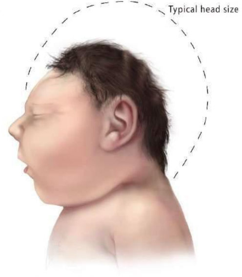
Baby with Severe Microcephaly