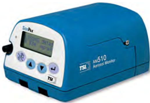
TSI SIDEPAK AM510 PERSONAL AEROSOL MONITOR