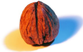
3 days of age