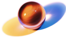
24 hours of age