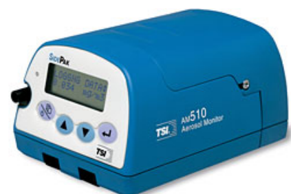
TSI SIDEPAK AM510 PERSONAL AEROSOL MONITOR

A minimum of 30 minutes was spent in each venue. The number of people inside the venue and the number of burning cigarettes were recorded every 15 minutes during sampling. These observations were averaged over the time inside the venue to determine the average number of people on the premises and the average number of burning cigarettes. Room dimensions were also determined using a combination of any or all of the following techniques; a sonic measuring device, counting of construction materials of a known size such as floor tiles, or estimation. Room volumes were calculated from these dimensions. The active smoker density was calculated by