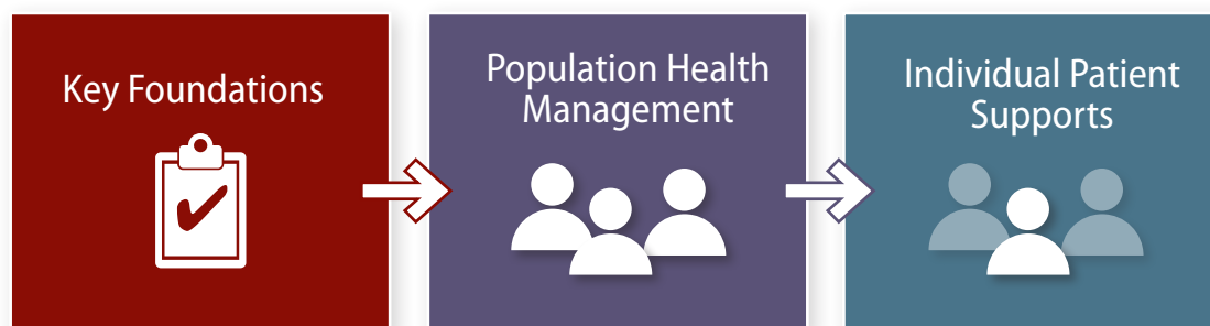
Figure 1. Hypertension Control Change Package Focus Areas

While the science behind cardiovascular risk reduction is continually evolving, there is strong evidence that a systematic approach to HTN management can significantly improve HTN-related care processes and outcomes. The purpose of the HCCP is to help healthcare practices put systems in place to care for patients with HTN more efficiently and effectively. The HCCP is broken down into three main focus areas (Figure 1):