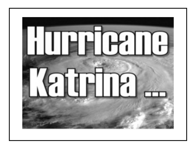
Over 80 members of the MDRS families suffered lossed, 6 with total loss of property. Four days after Katrina made landfall members of the MDRS staff traveled to the Gulf Coast with food, water, supplies and equipment.