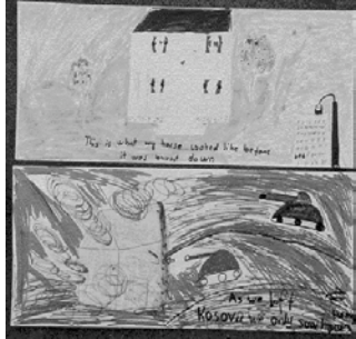
Kosovo school art