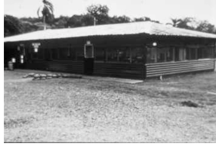
Meeting hut, Empire Range, JTF safe haven