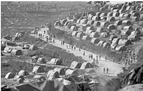
Kibeho refugee camp, Ruwanda, 1994