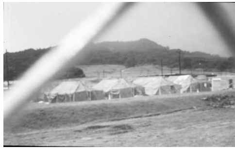
JTF safe haven, Panama 1995