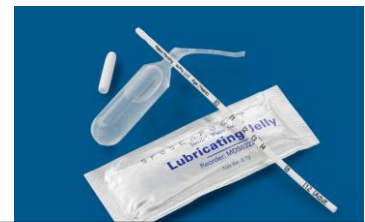
N-Pak™ Nasopharyngeal Bulb Aspiration Kit http://www.nasalaspirationkit.com/index.html