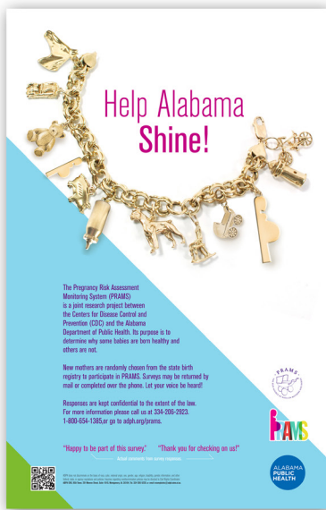
PRAMS POSTER 11"x17"