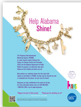
PRAMS POSTER 8.5"x11"