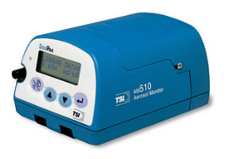
TSI SIDEPAK AM510 PERSONAL AEROSOL MONITOR

were averaged over the time inside the venue to determine the average number of people on the premises and the average number of burning cigarettes. Room dimensions were also determined using a combination of any or all of the following techniques; a sonic measuring device, counting of construction materials of a known size such as floor tiles, or estimation.