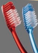
personal care items