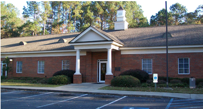
Alexander City Branch