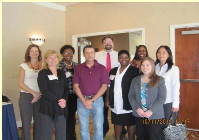
Greetings for ASCR past and present staff!!