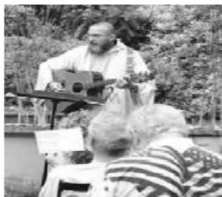
The Monastery of the Holy Spirit Spiritual Healing Retreat for Veterans