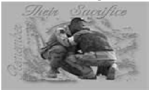
St. Ann Vets Helping Vets St. Ann Catholic Church