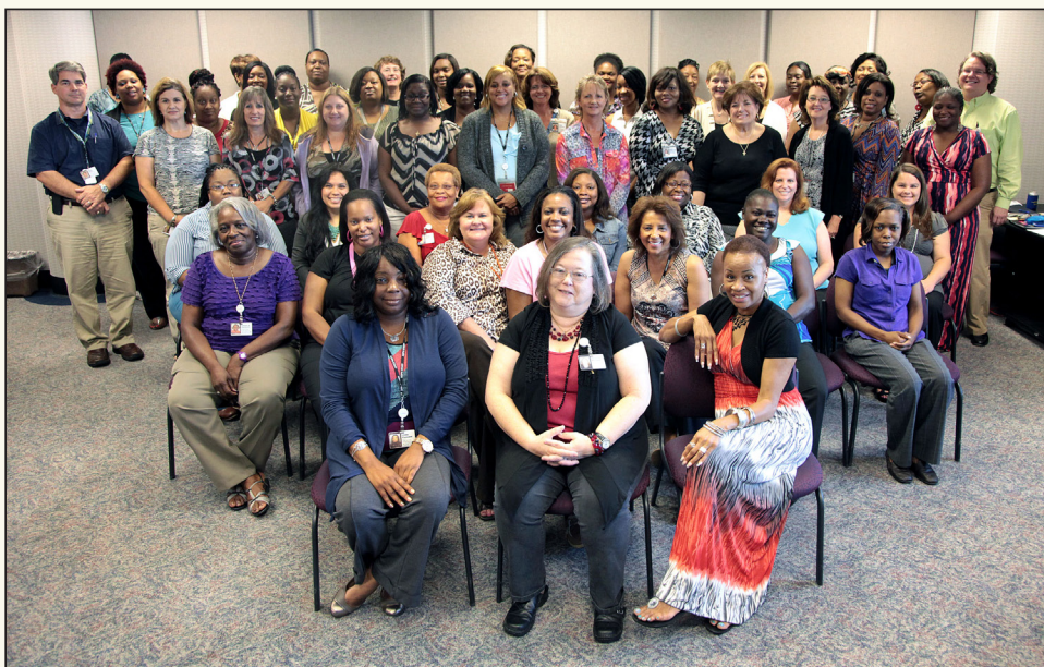
Employees of the Bureau of Children's Health Insurance gathered for a group photo recently as they celebrated 15 years of service to Alabama's children and families through the ALL Kids program.

ALL Kids has provided comprehensive healthcare coverage to over 337,000 children since its inception. As you can imagine, that enrollment figure has made a profound impact on the health of Alabama's most vulnerable citizens – its children.