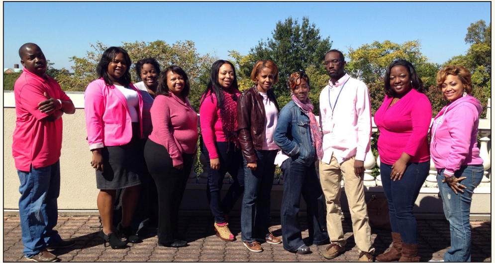
The Dannon Project staff implements and engages in activities to support health awareness.

The Dannon Project provides participants with direct linkages to health care services and social service agencies to promote a holistic approach to health and wellness. The project has worked to integrate health screenings and health information into community reentry and orientation services to encourage staff and clients to healthy choices that will improve their physical and mental health.