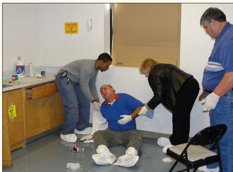
Radiation Control provides hands-on training to area responders.