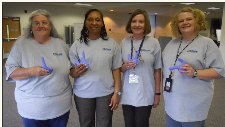
Quality Improvement Train-the-Trainer participants from public health areas and the Central Office presented inventive teach-back sessions about QI tools and reports about their mini-QI projects. Shown are some team members from the bureaus of Children’s Health Insurance, Clinical Laboratories, Family Health Services, Public Health Area 2 and others.