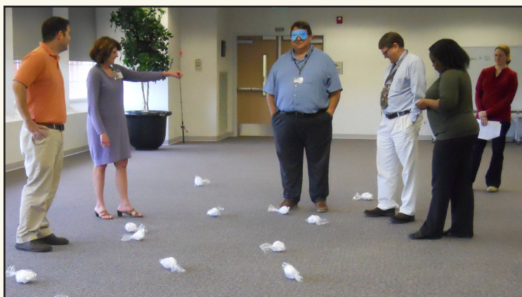
Quality Improvement Train-the-Trainer participants from public health areas and the Central Office presented about the mini-projects they developed. Shown are some team members from the Bureau of Family Health Services, the Children’s Health Insurance Program, and the Bureau of Clinical Laboratories.