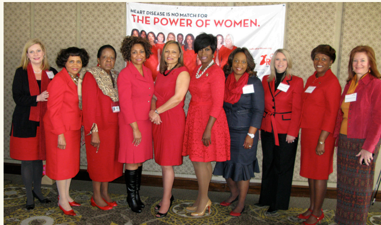
Alabama elected officials and American Heart Association volunteers, including departmental employees and Baptist Health staff, participated in a legislative breakfast Feb. 13.