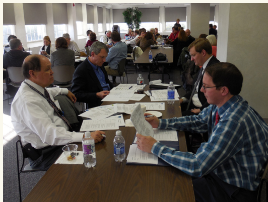
Domain workgroups gathered to map their strategies for accreditation.