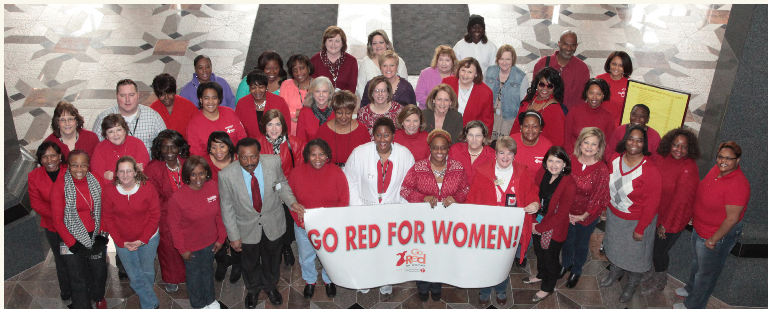
Employees in the RSA Tower joined together in support of National Wear Red Day, Feb. 7.

Ask your provider about how often to check your cholesterol.