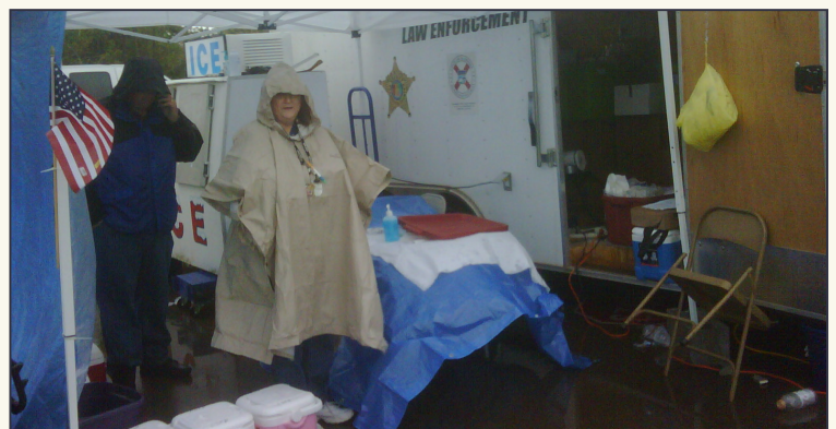
'Neither rain, nor storms, nor dark of night' deterred this nurse/clinic team from Public Health Area 2 from providing a tetanus clinic for disaster workers in the rain on May 3.