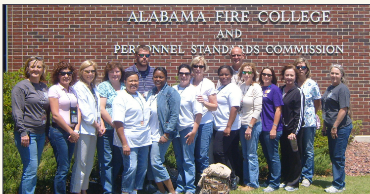
The Public Health Area 7 team is pictured with some staff from Public Health Area 9 at the Medical Needs Shelter location.