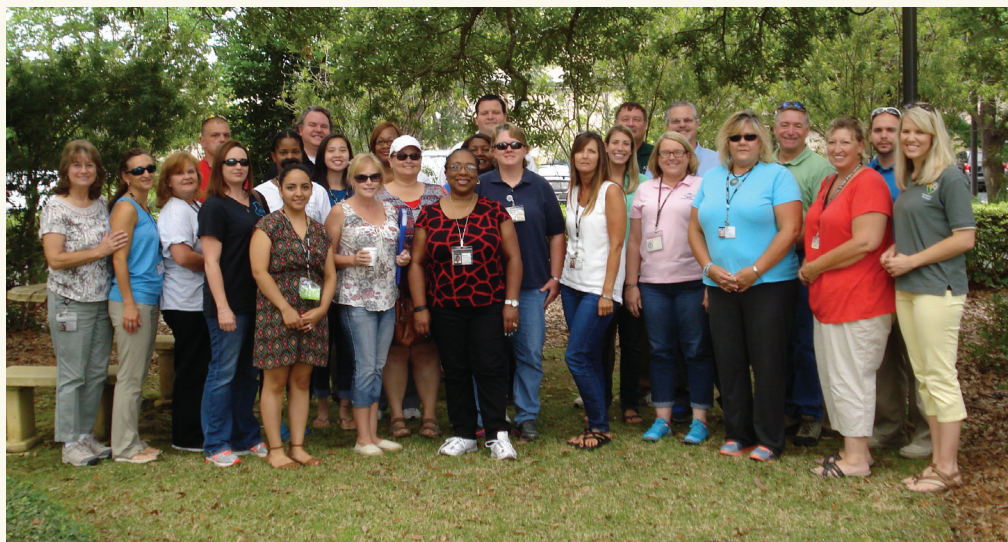
Some of the team members who participated in the CASPER based in Gulf Shores in June gathered for this group photograph.