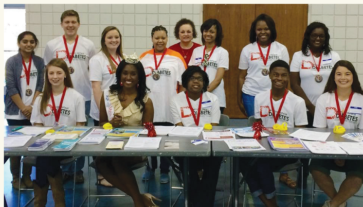
Jefferson County students promote diabetes awareness.