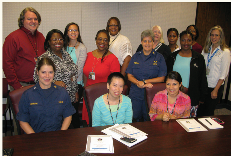
ClubEpi has met regularly since April 2010. Some of the members attending the Aug. 13 meeting in the RSA Tower are shown here.

ClubEpi members are involved in several workforce development efforts, including the development of a data skills and training needs assessment. Additionally, ClubEpi members actively participate in public health emergency preparedness and response activities