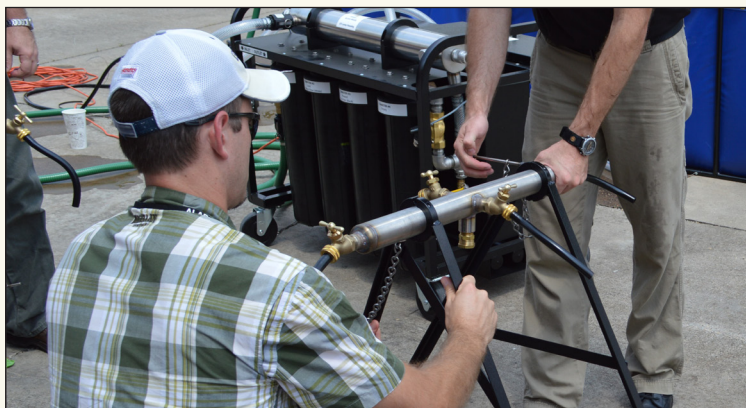
Environmentalists from county health departments and area emergency preparedness teams receive water filtration training.