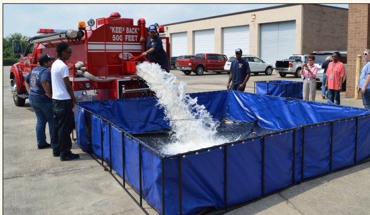
The new equipment offers high capacity, speed and versatility to meet critical needs.