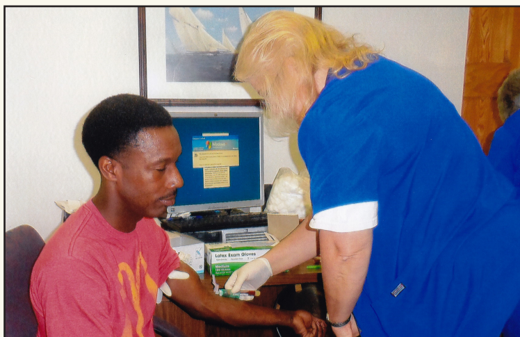
County health departments promoted men's health by holding many health promotion events during June.