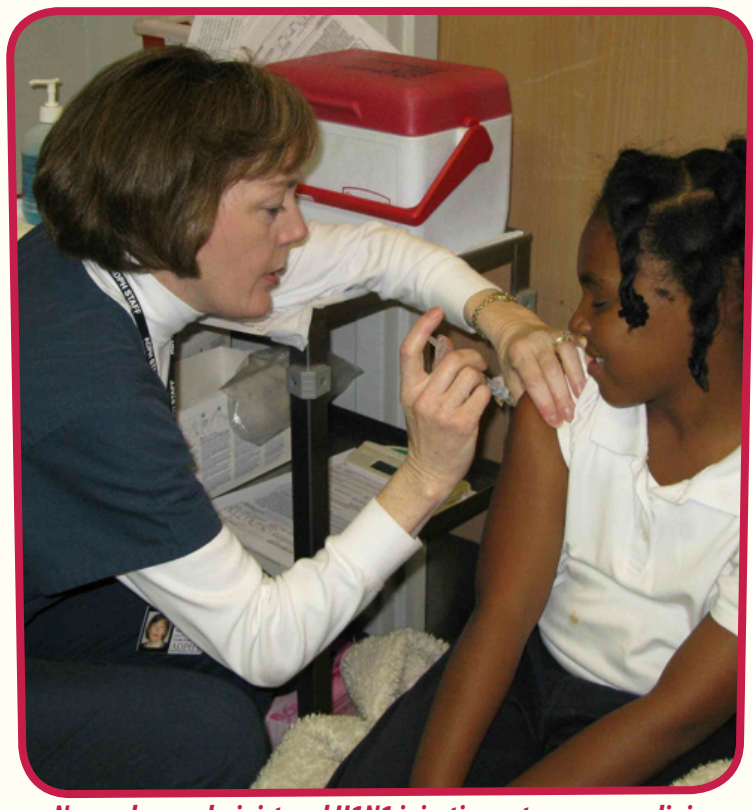
Nurses have administered H1N1 injections at numerous clinics, including many held after hours.