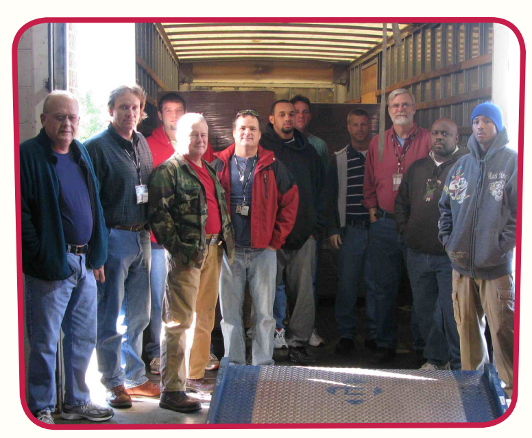
Public health employees from various bureaus delivered H1N1 vaccine to locations throughout the state.