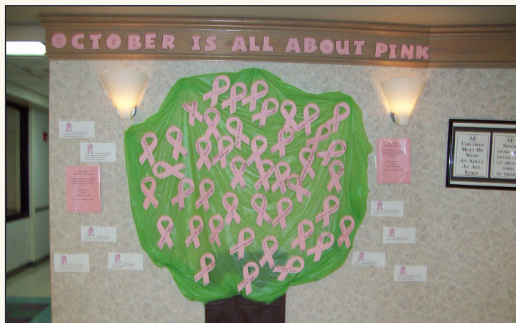
Employees decorated the Tree of Hope for the lobby.

In addition to sporting T-shirts and decorating the Tree of Hope, staff members hung a large pink bow on the front door and hoisted a banner that read, "We Support Breast Cancer Awareness Month," to show to all those who entered the DeKalb County Health Department. A celebration also was held to recognize those women who have fought the fight against breast cancer.