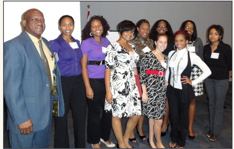
Graduate students in public health participated in the second forum at Tuskegee University.

For more information on the National Partnership for Action Plan and Office of Minority Health initiatives to address health disparities in Alabama, please call (334)206-5396 or email omh@adph.state.al.us.