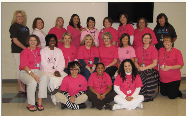
Staff members posed for this photo to support breast cancer awareness in DeKalb County.