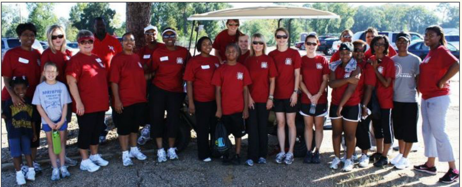
Public health employees turned out for the 5K walk in Tuscaloosa.