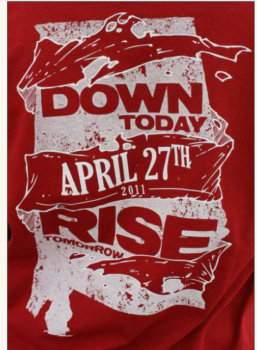
T-shirts for participants commemorated the April 27 tornadoes and recovery.