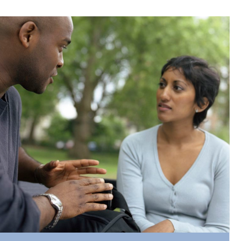
Share concerns with friends.