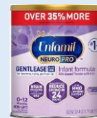
Enfamil NeuroPro Gentlelease