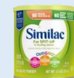
Similac For Spit Up