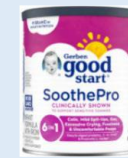
Gerber Good Start SoothePro