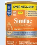
Similac 360 Total Care Sensitive