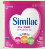
Similac Soy Isomil

Your baby can use most types of soy-based infant formula, so you have several options.