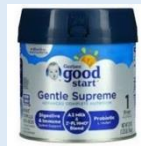
Gerber Good Start Gentle Supreme