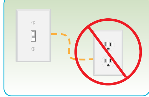
Do not use outlets that are controlled by wall switches.