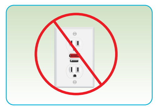
Do not use outlets that have built-in circuit switches (they have red reset buttons).