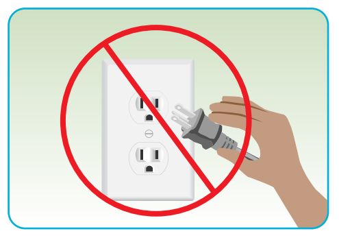
Never unplug the vaccine refrigerator or freezer.