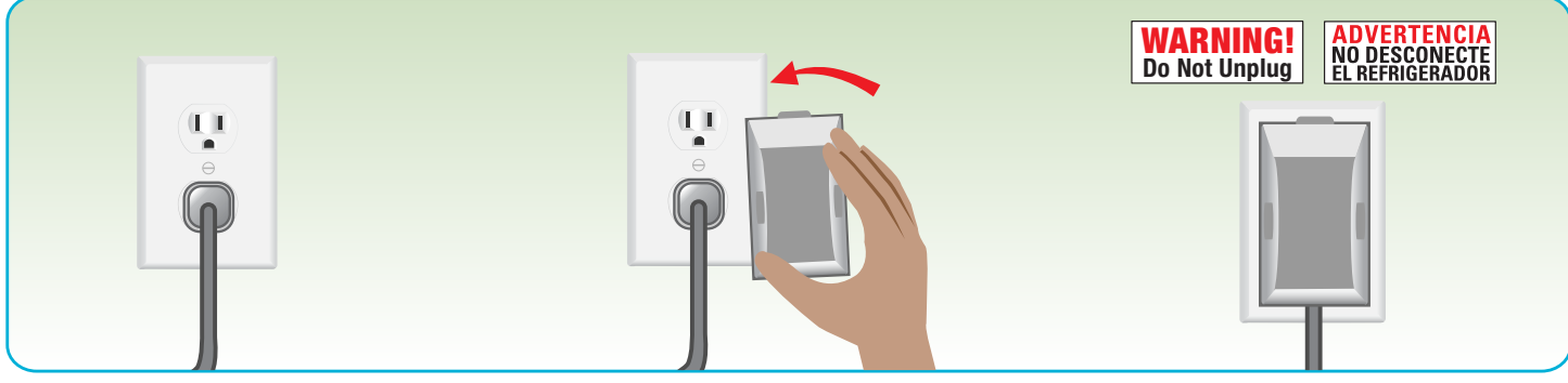
Plug in vaccine storage unit to a nearby outlet.