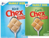
Rice Chex, Corn Chex