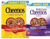
★ Cheerios, Multigrain Cheerios