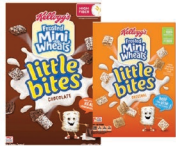
★ Frosted Mini Wheats Little Bites, Chocolate, Original