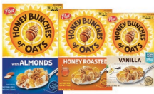
Honey Bunches of Oats with Almonds, Honey Roasted, Vanilla Bunches