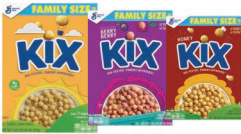
★ Kix, Kix Berry, Kix Honey