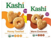
★ Kashi Honey Toasted and Warm Cinnamon