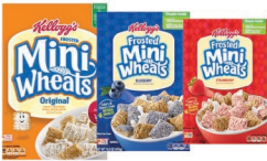
★ Frosted Mini Wheats Original, Strawberry, Blueberry