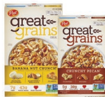
★ Great Grains Banana Nut Crunch and Crunchy Pecan