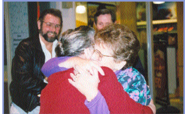
Mother and daughter exchange their first hugs.